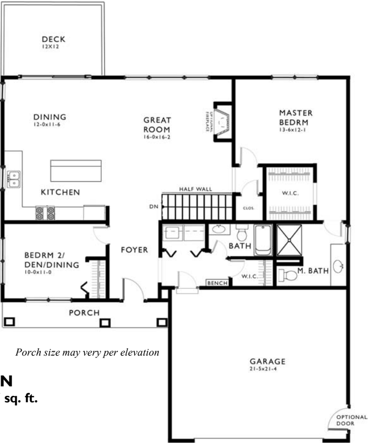
MAIN 1,307 sq. ft.